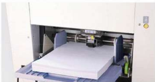
Innovative design of paper feeding by double rollers which is much more stable. Simultaneously feed paper to guarantee one page input only once.